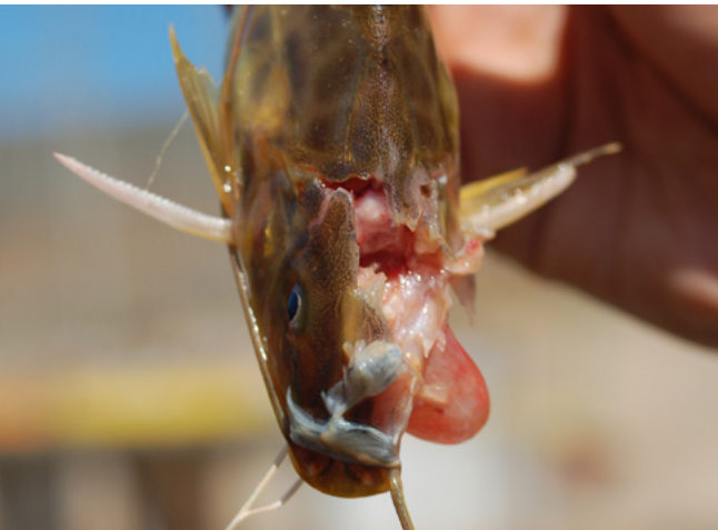
Yellow mandi with a skull fracture after collision with hydropower plants turbines.